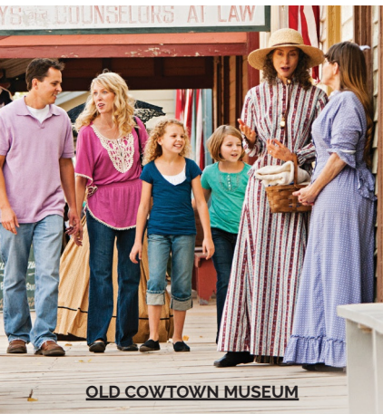
OLD COWTOWN MUSEUM