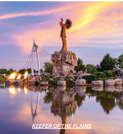
KEEPER OF THE PLAINS