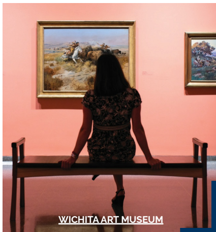
WICHITA ART MUSEUM